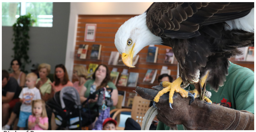
Birds of Prev